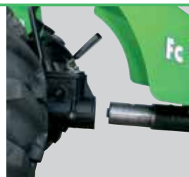
FAST COUPLING The built-in fast coupling allows replacement of various implements with maximum ease.