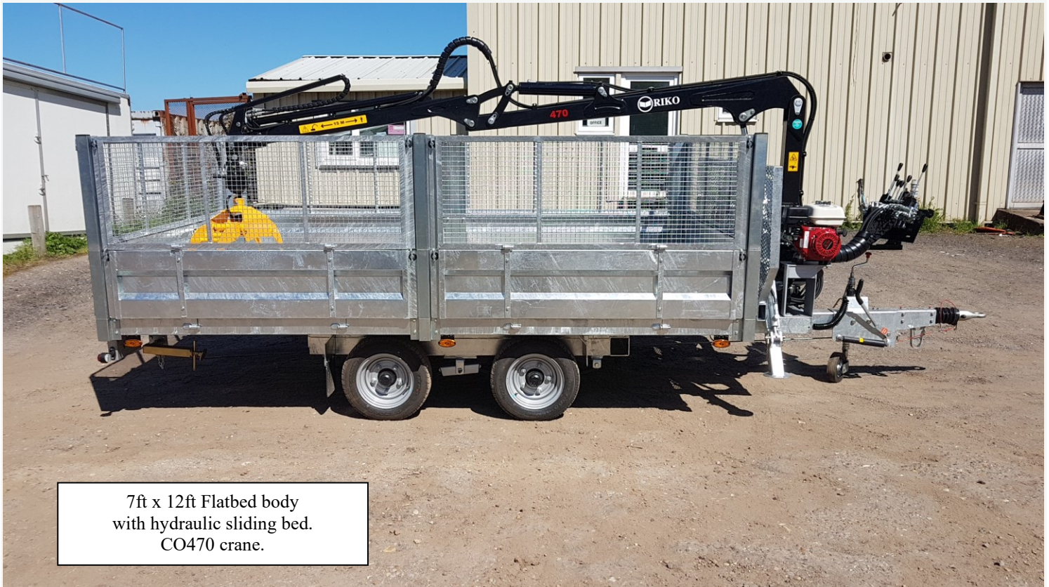
7ft x 12ft Flatbed body with hydraulic sliding bed. CO470 crane.