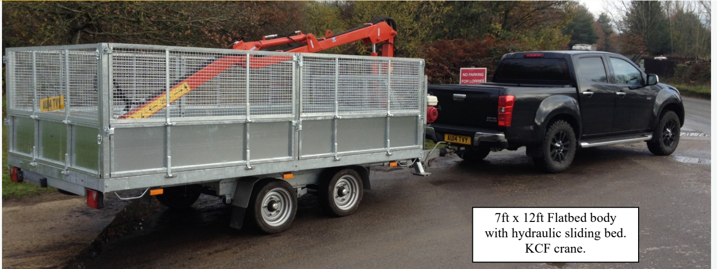
7ft x 12ft Flatbed body with hydraulic sliding bed. KCF crane.