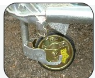
Check the nose weight.*