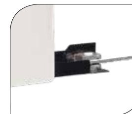
Adjustable blade guide arm with ceramic guides.