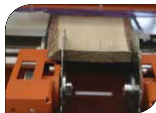
Two circular blades

5.5 kW electric motor (standard) Sufficient power to process boards, but low overall power consumption to lower utility bills.