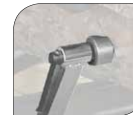
Clamp Tip allows for a 25 mm last cut.