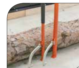
Cant Hook (option) is a traditional tool to roll, lift, move, and pivot logs. Available lengths of handle: • 70 cm • 120 cm

Gas Engine version – Easy-to-activate clutch and throttle lever.