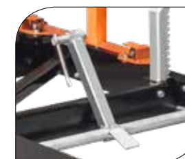
Quick-set log clamp.