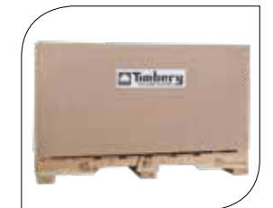
Simple shipping on a single pallet.