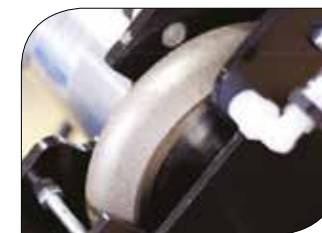
CBN Grinding Wheel 127 mm (5")