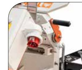
Sawyer has quick and easy access to: head up and down crank, blade guide arm, and blade control lever.