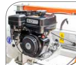
9 HP or 14 HP Gas Engine