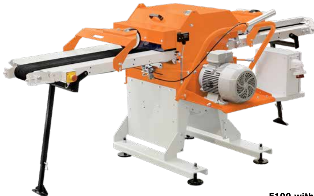
E100 with 5.5 kW Electric Motor

Two circular blades are provided standard, one is fixed, and the other adjustable. A removable board fence makes it easy to trim boards that already have one straight side. The E100 breaks down into a compact configuration for shipment.