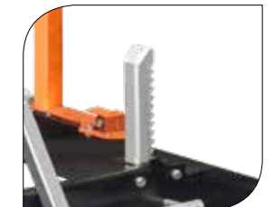
Quick-set log rests can be adjusted with one hand.