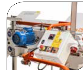
4 kW or 5.5 kW Electric Motor