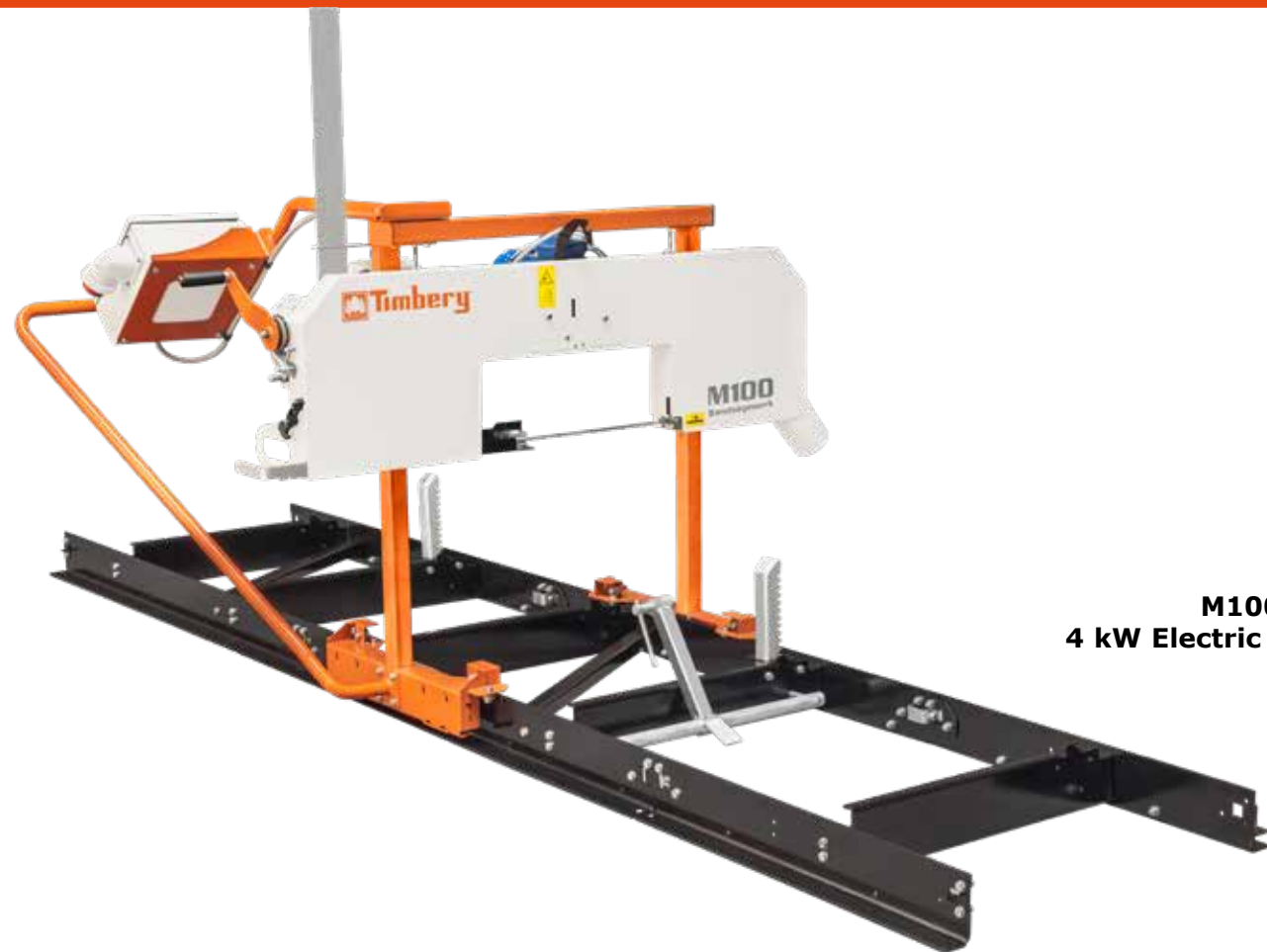
M100 with 4 kW Electric Motor